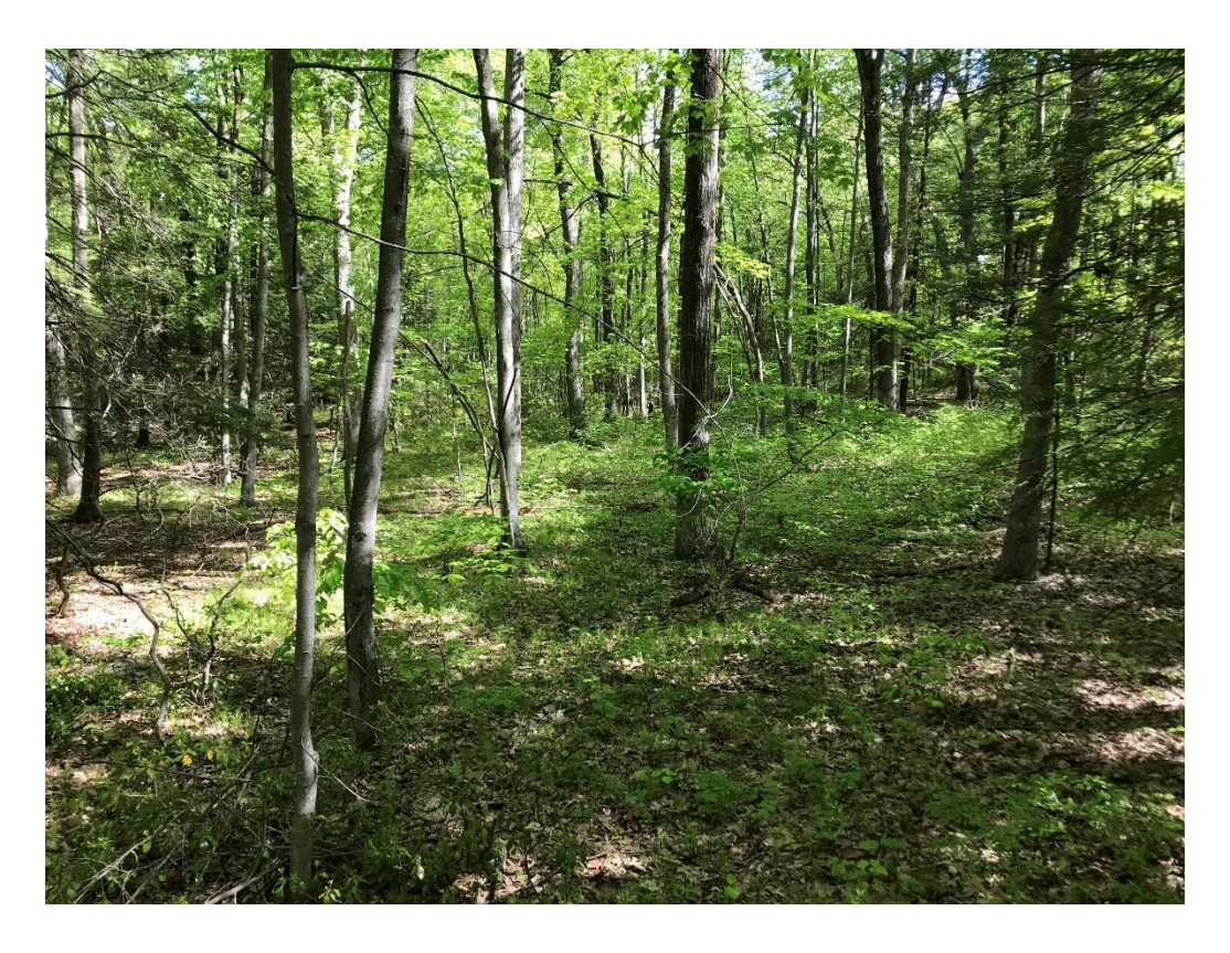
Upland Forest on the Fratelli Zeta Property.