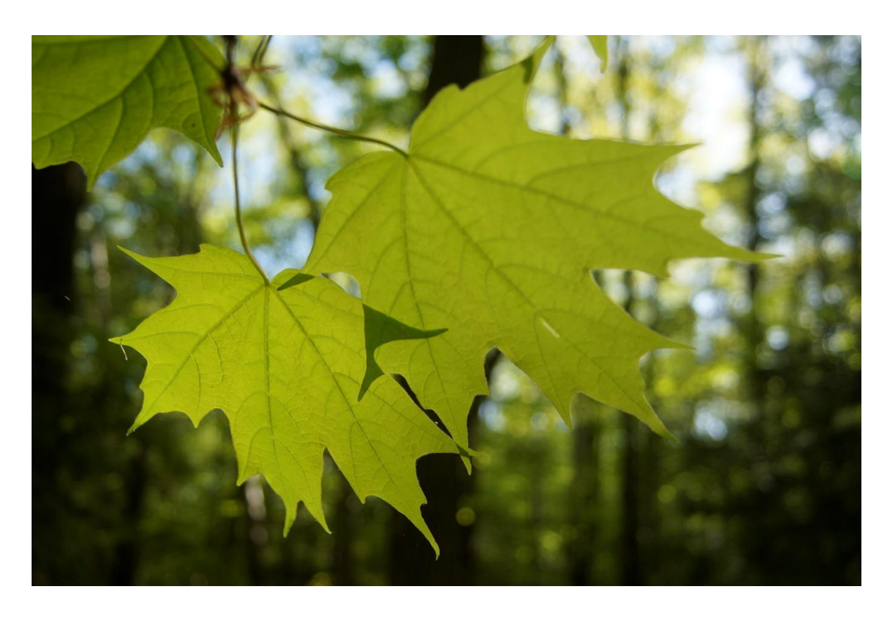
Sugar Maple – a Native Tree Species designated as a Species of Greatest Conservation Need in CT's Wildlife Action Plan – is a characteristic Species of the Site's Mesic Forest Canopy