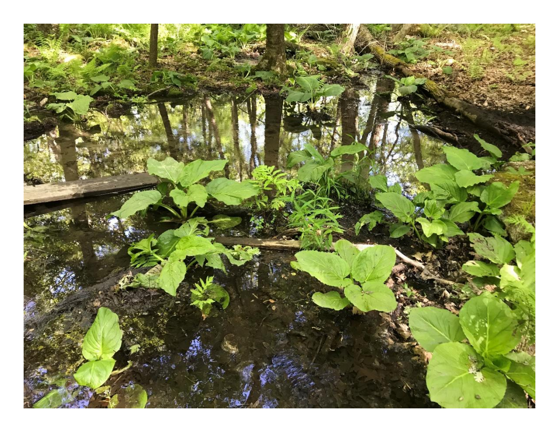
The Vegetated Wetland Bordering the Intermittent, Headwater, Tributary Stream