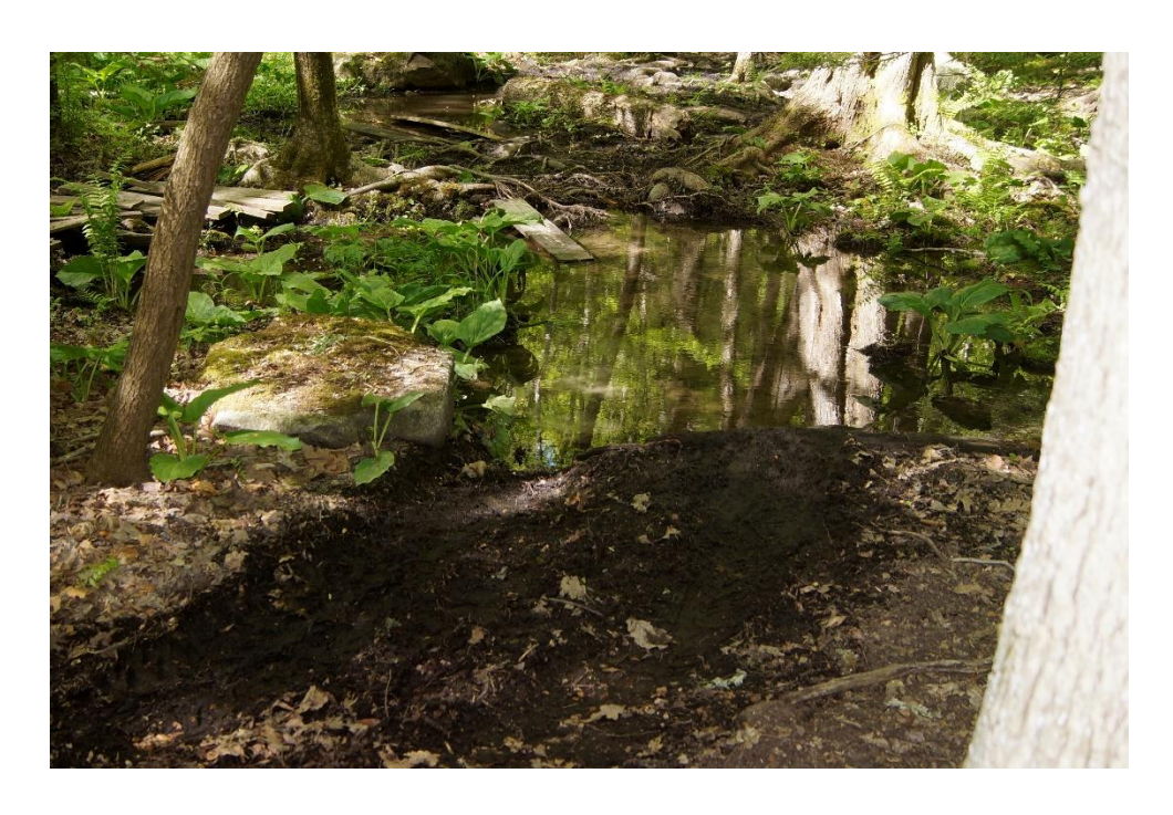
A Trail Transects the Property in an East-West Orientation