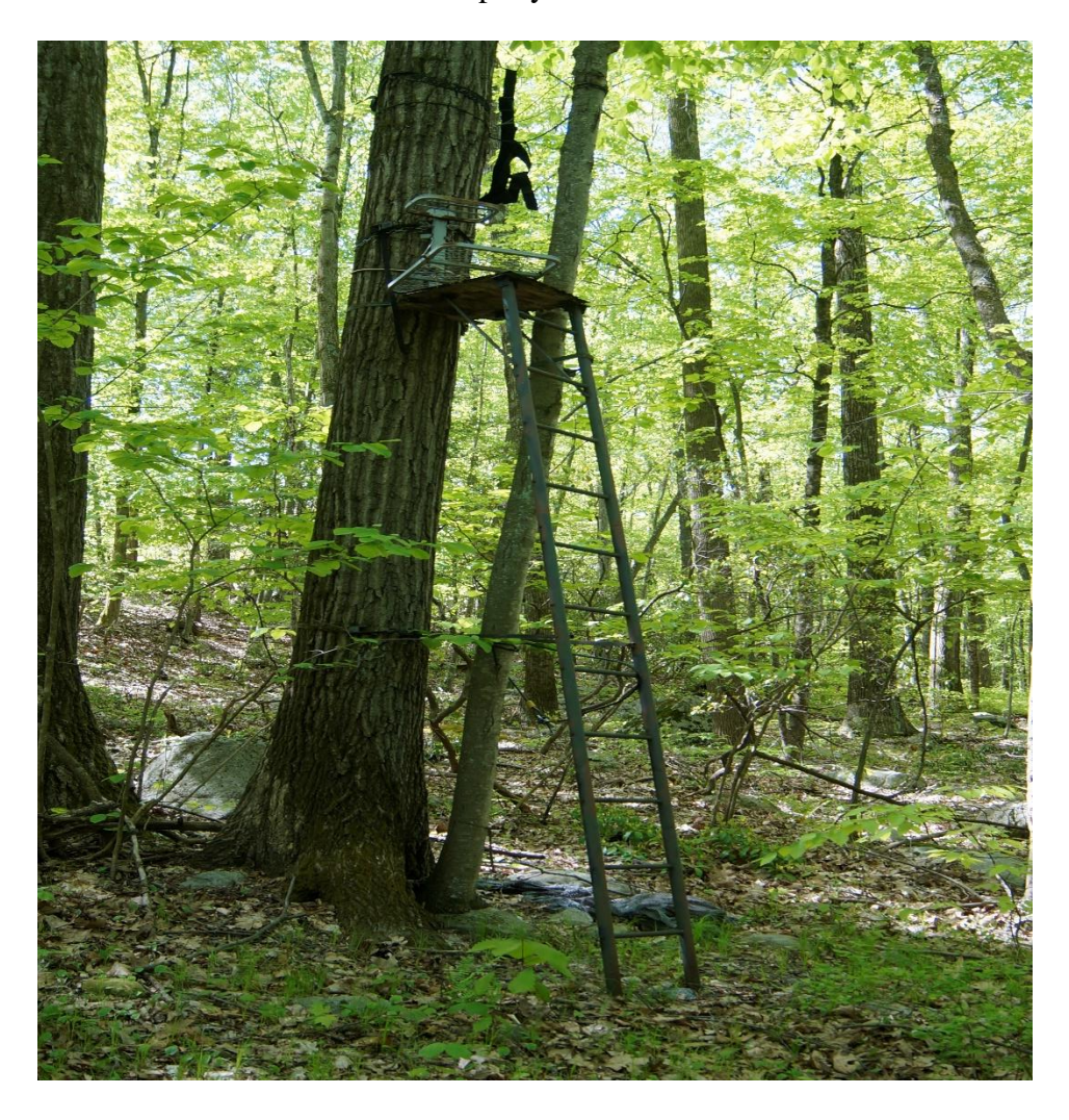
Evidence of Deer Hunting Occurring on the Property.