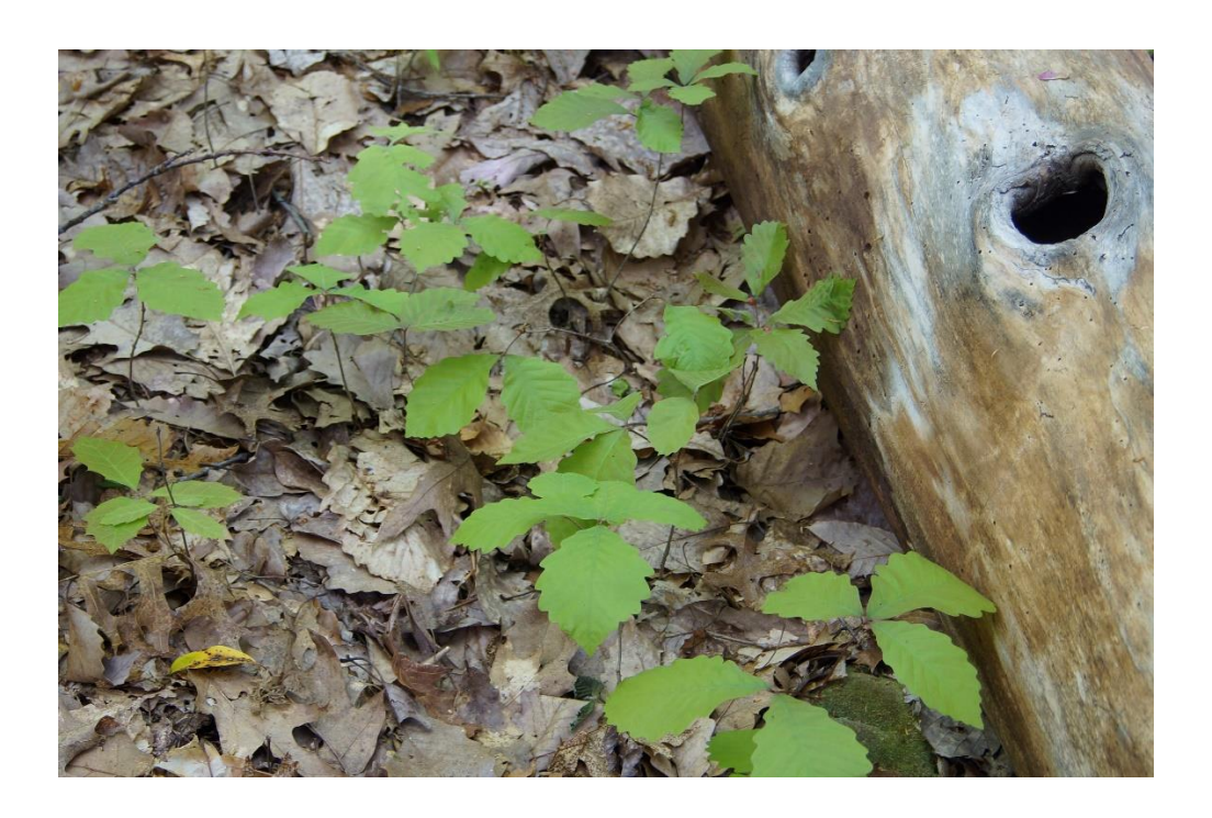
Chestnut Oak Seedlings have Sprouted in the More Xeric Portions of the Forest Slope.