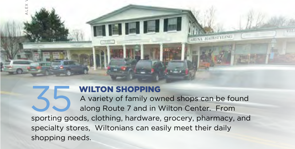
ALEX VON KLYDORFF

A variety of family owned shops can be found along Route 7 and in Wilton Center. From sporting goods, clothing, hardware, grocery, pharmacy, and specialty stores, Wiltonians can easily meet their daily shopping needs.