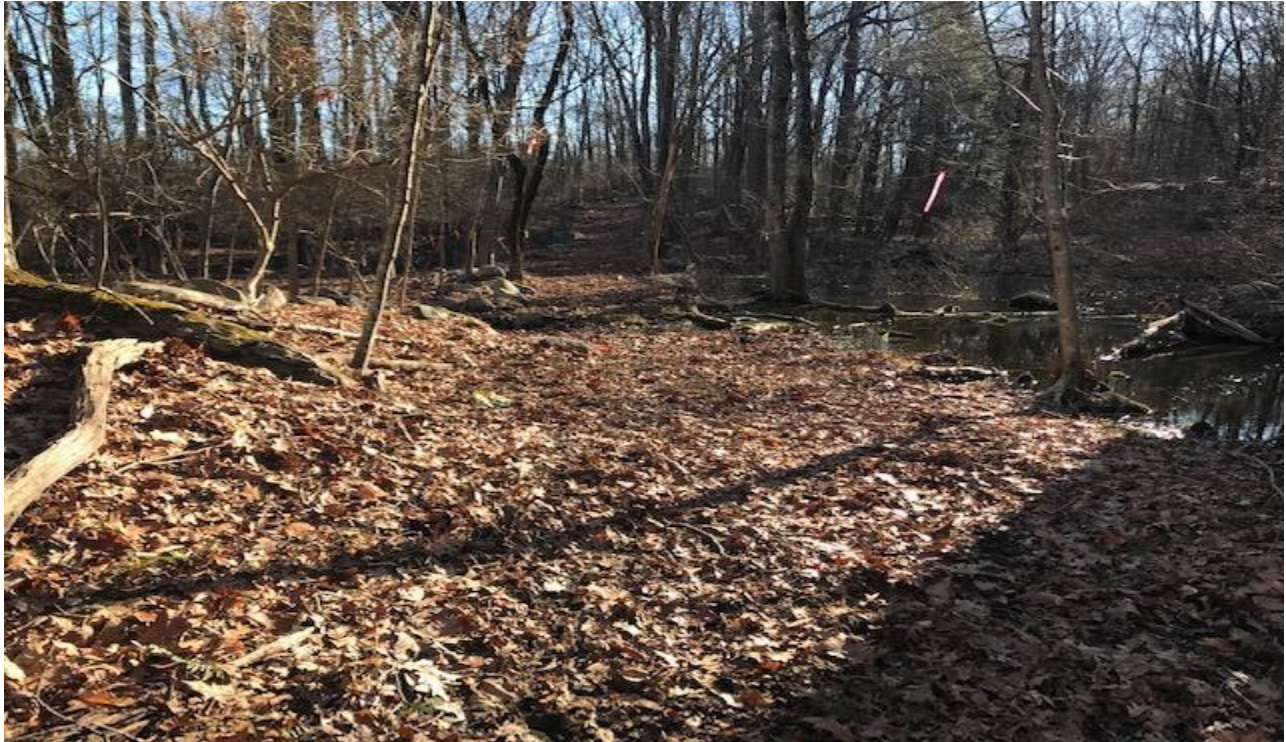
View of the wetland buffer area from the north

Based on my site inspection, there was no disturbance noted with the wetland or wetland buffer area. The site was in compliance.