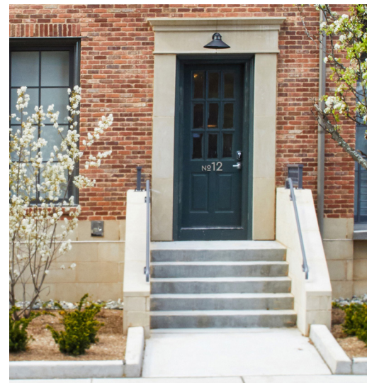
3. Front Stoop