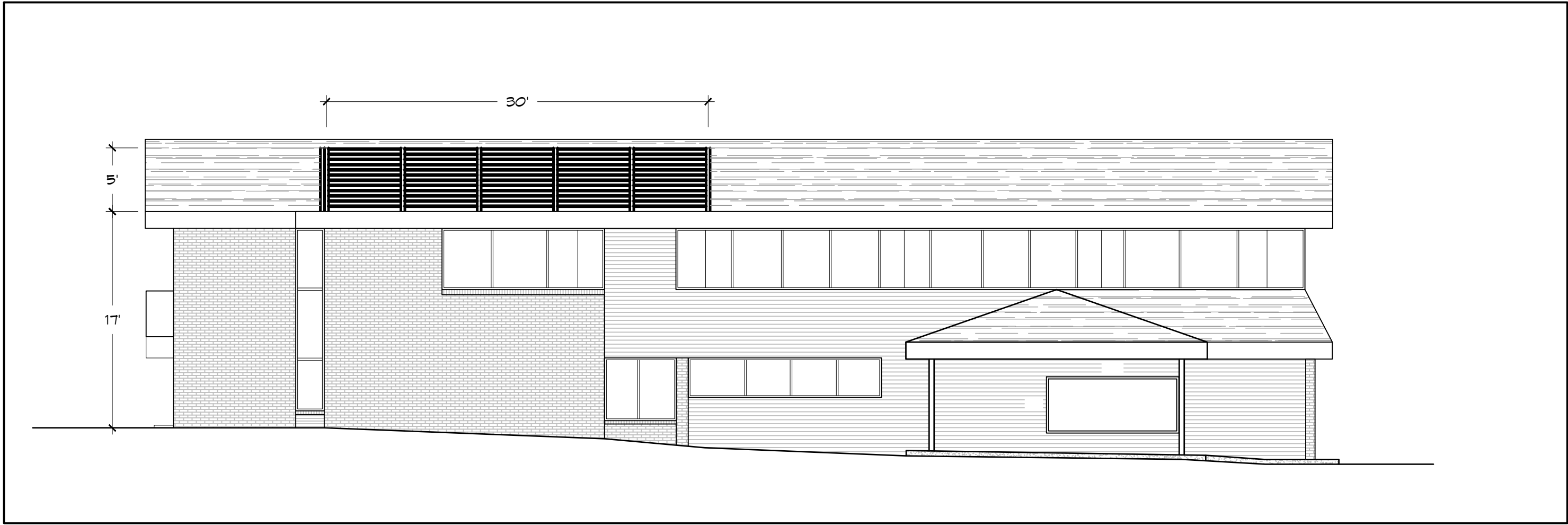
2 PROPOSED NORTH ELEVATION SCALE: 1/8" = 1'-0"