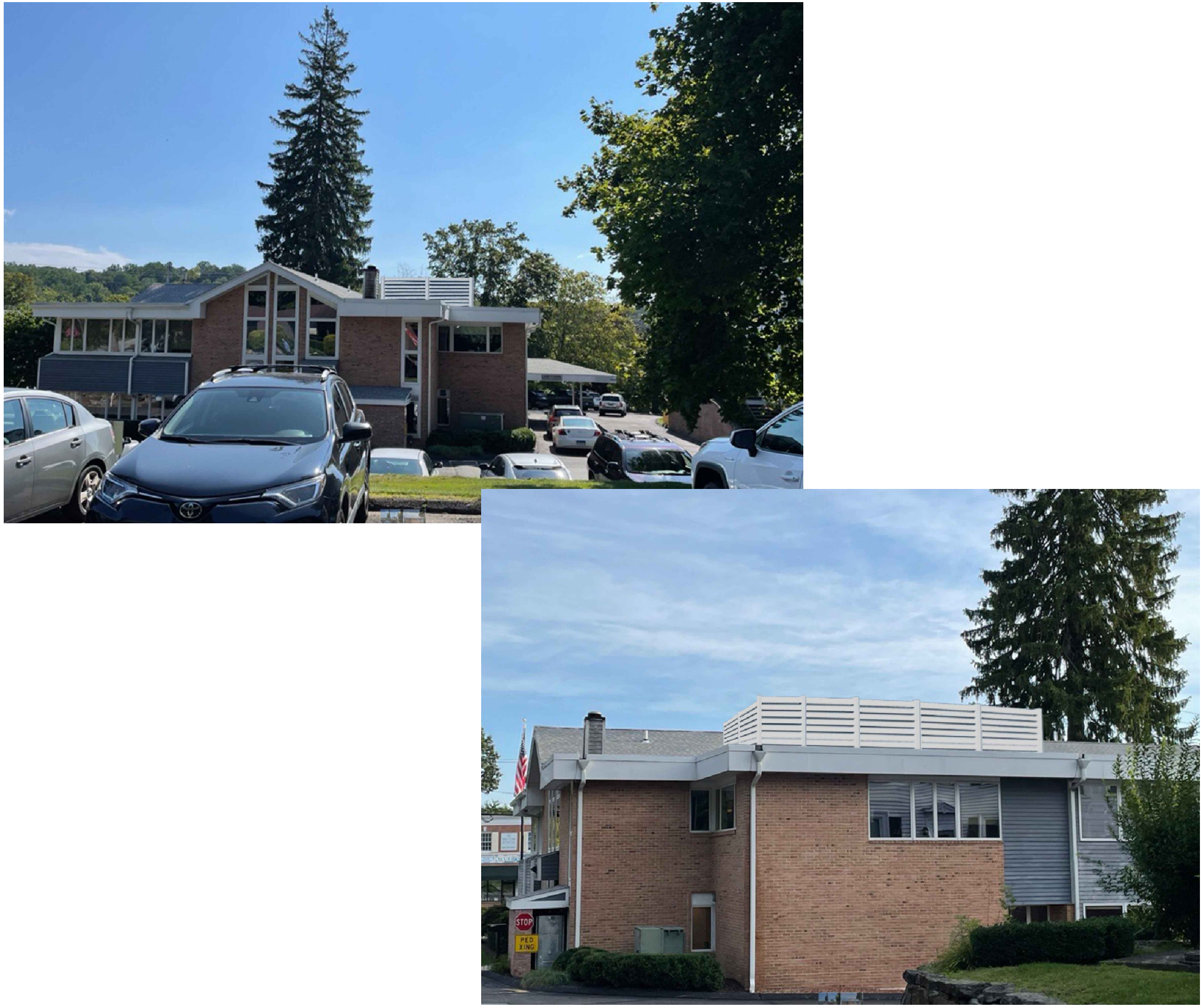
4 UTILITY SCREENING EXAMPLE - ALUMINUM POSTS & ALUMINUM PLANKS - COLOR MATCH TO BUILDING TRIM SCALE: N.T.S.