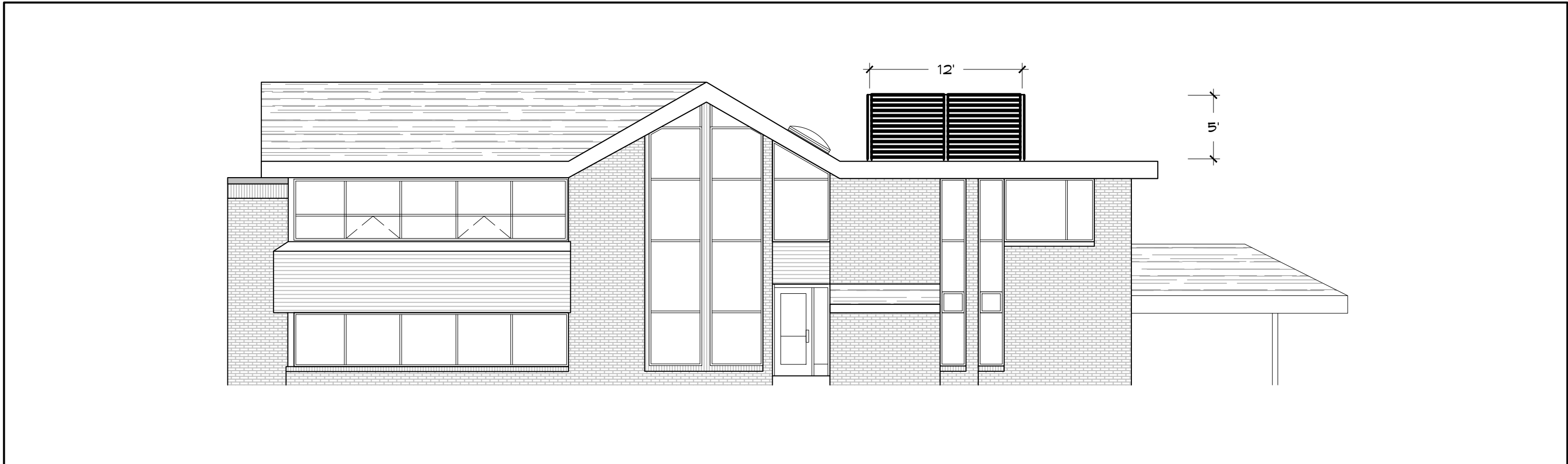
3 PROPOSED EAST ELEVATION SCALE: 1/8" = 1'-0"