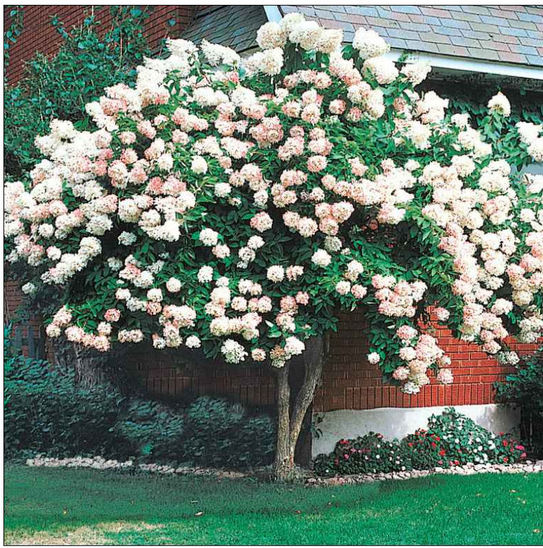
TREE FORM HYDRANGEA *NATIVE TREE SPECIES TO CONNECTICUT. *TREE SHOWN AT MATURE SIZE. *TO BE PLACED WHERE THE REMOVAL OF TREES WILL BE. *TOTAL OF THREE NEW TREES TO BE PLACED ON PROPERTY.