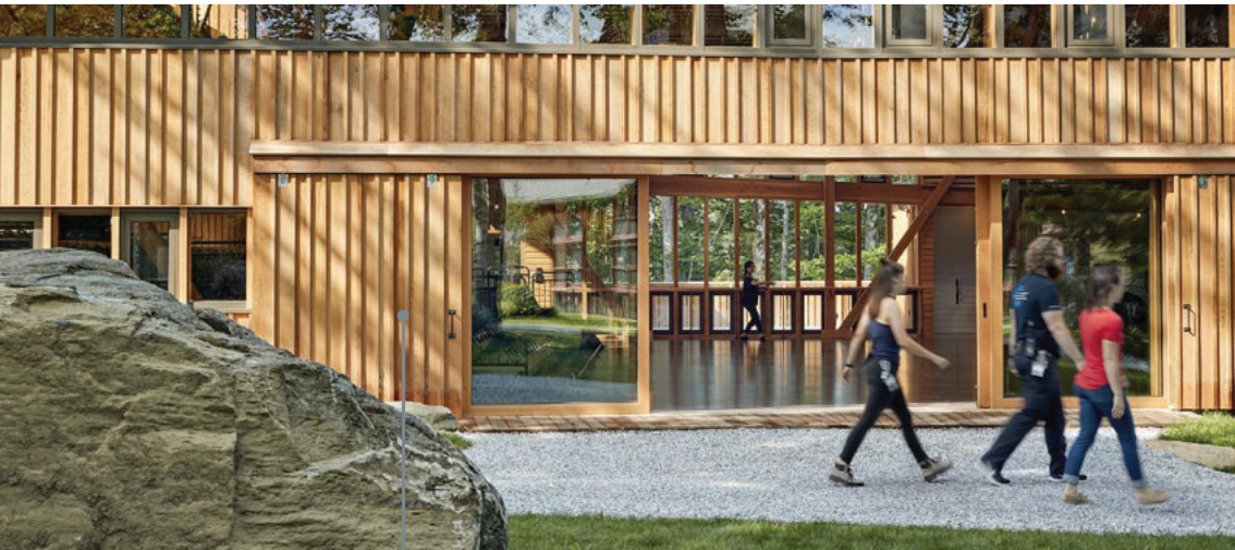
THE USE OF SELECT MATERIALS TO ALLOW THE BUILDING TO HAVE A SENSE OF WARMTH AND TIE INTO THE MORE RESIDENTIAL CHARACTER OF THE NEIGHBORHOOD. MATERIAL IS LIKELY TO HAVE THE CHARACTER OF WOOD BUT PROVIDE APPROPRIATE MAINTENANCE CHARACTERISTICS.