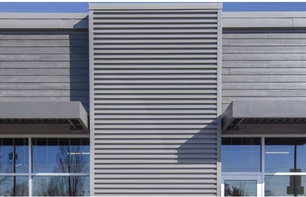
USE OF GLAZING TO ALLOW FOR TRANSPARENCY AND EXPOSURE TO THE LANDSCAPE AT ALL VIEWS