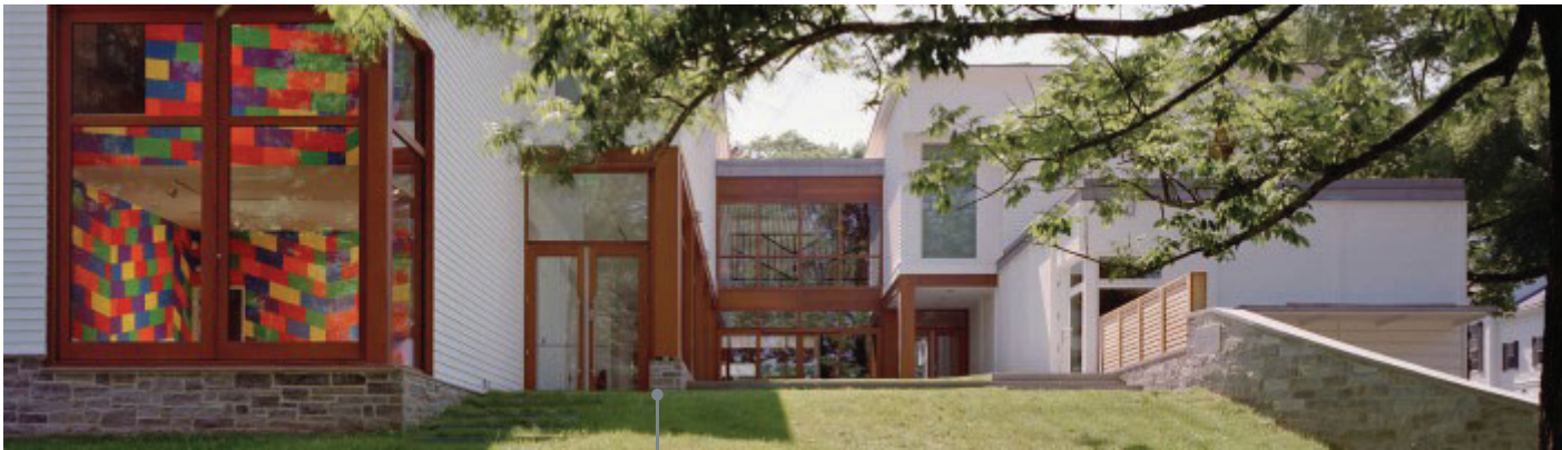
BUILDING THAT WORKS WITH THE LANDSCAPE