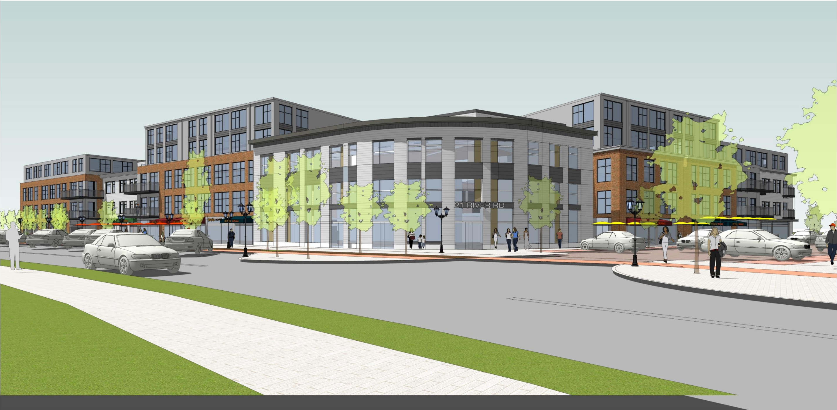
RENDERINGS - STREET VIEWS