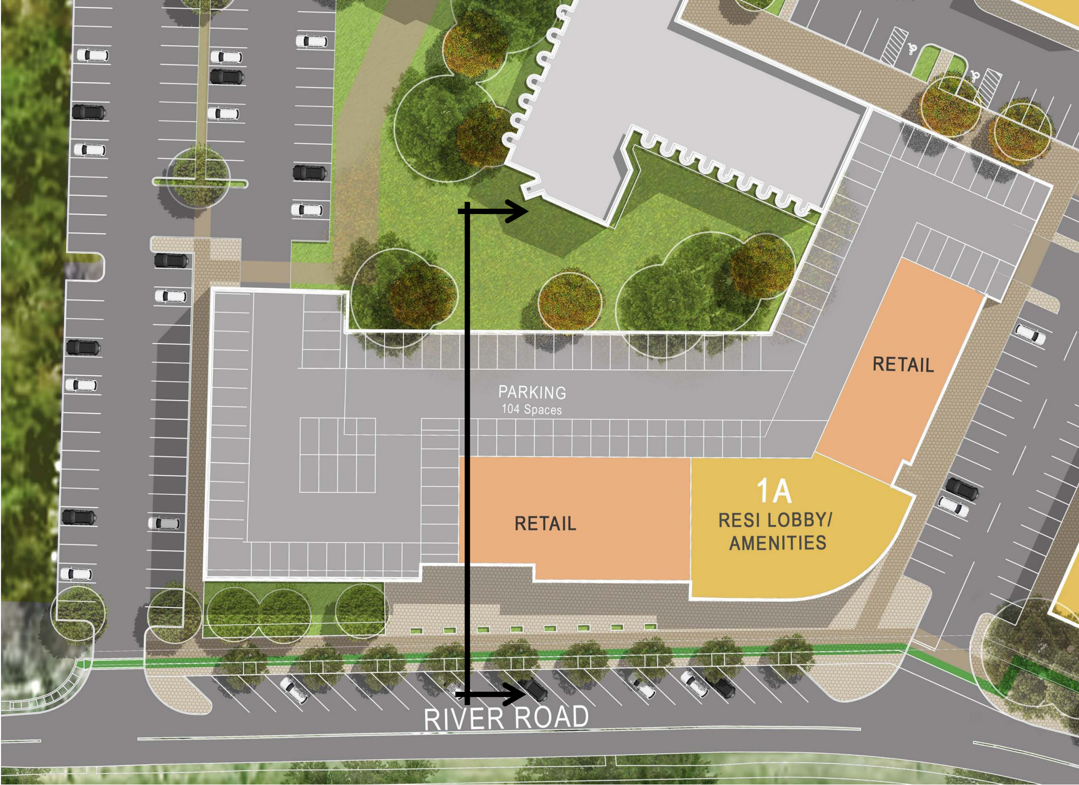
BUILDING 1A SITE PLAN