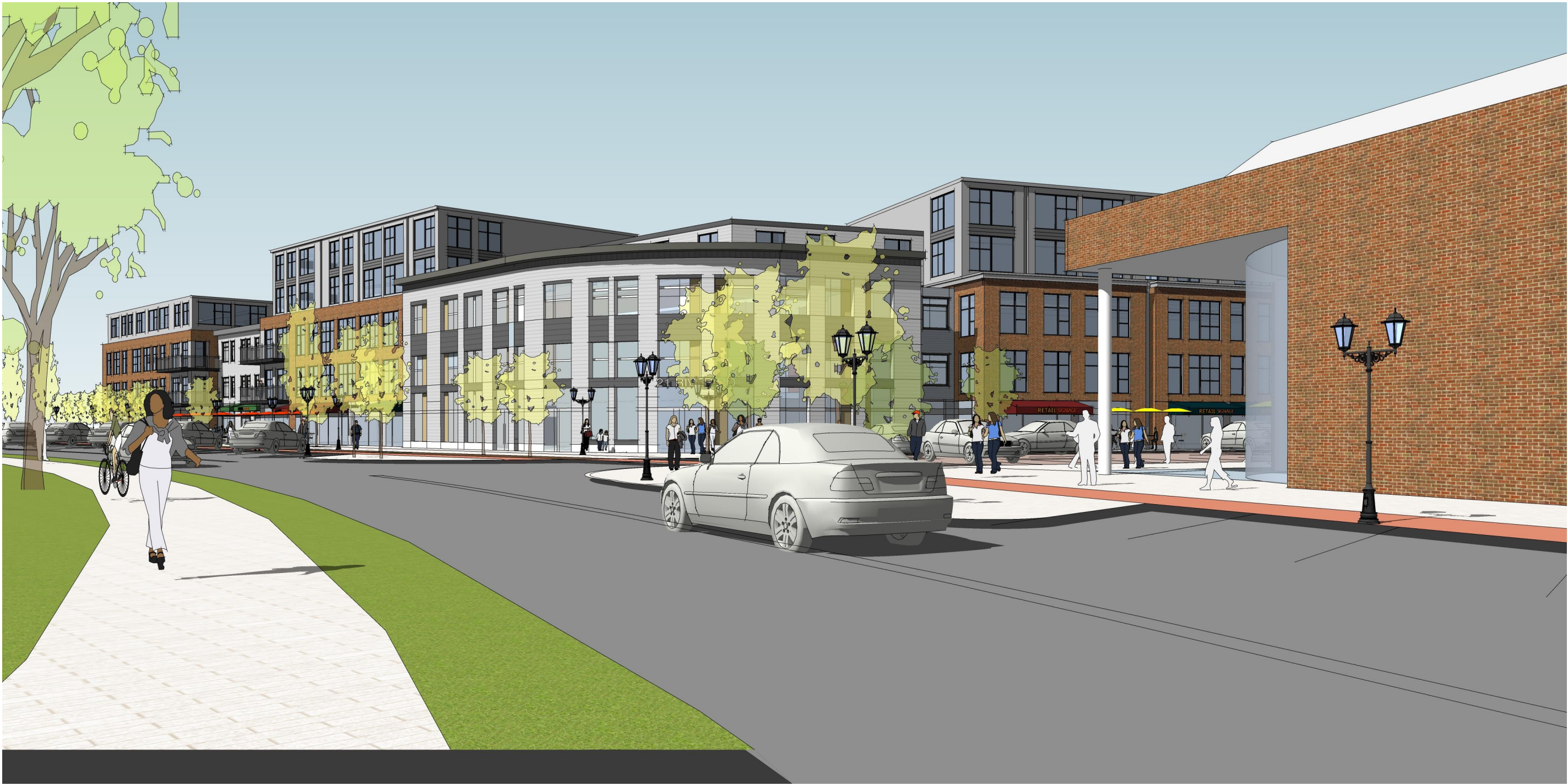
RENDERINGS - STREET VIEWS