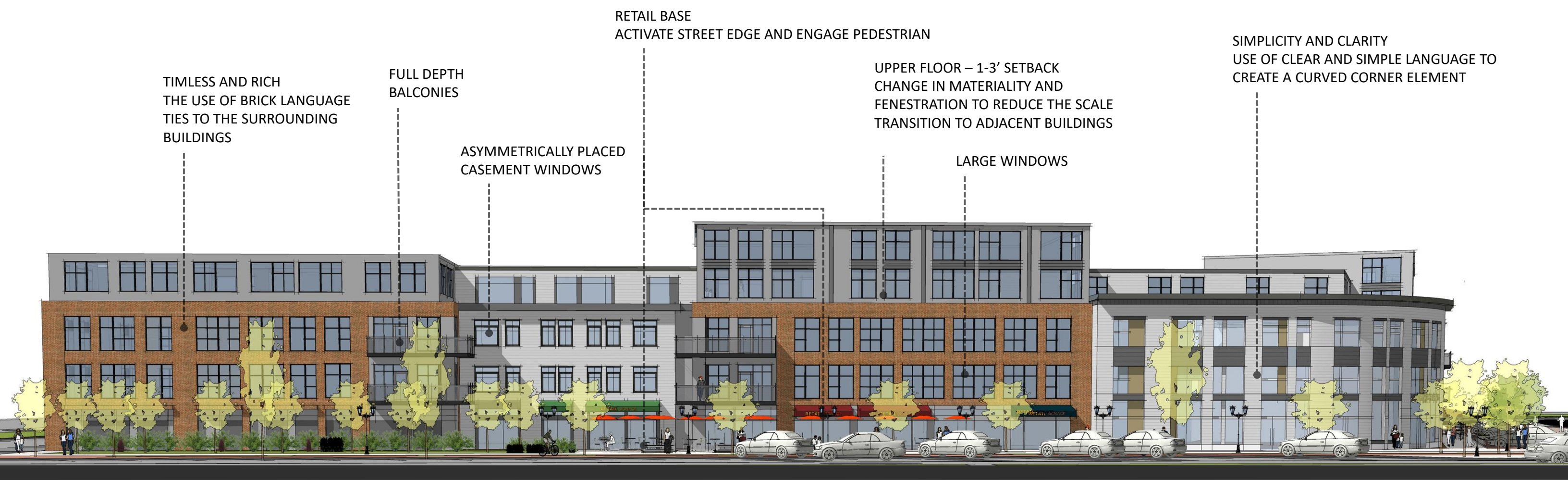
BUILDING 1A FACADE