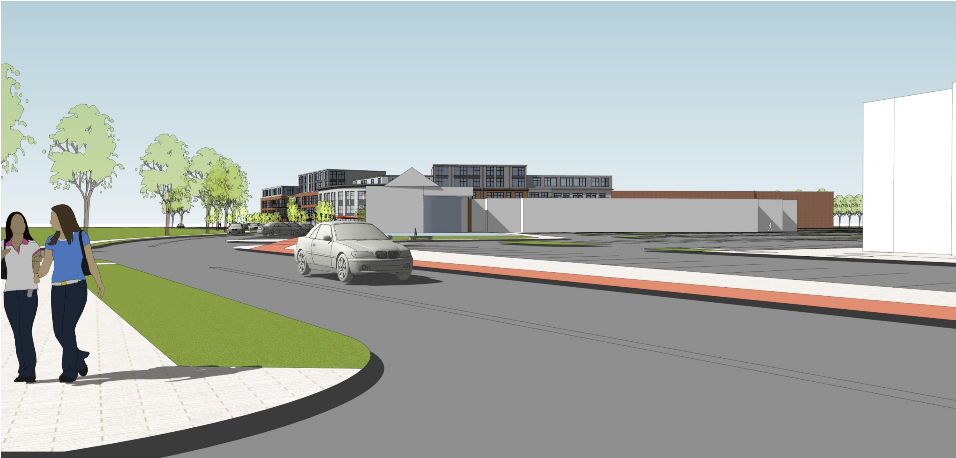
VIEW FROM RIVER ROAD DRIVING SOUTH

SERIES OF VIEWS SHOWING HOW THE BUILDING IS VISIBLE FROM RIVER RD