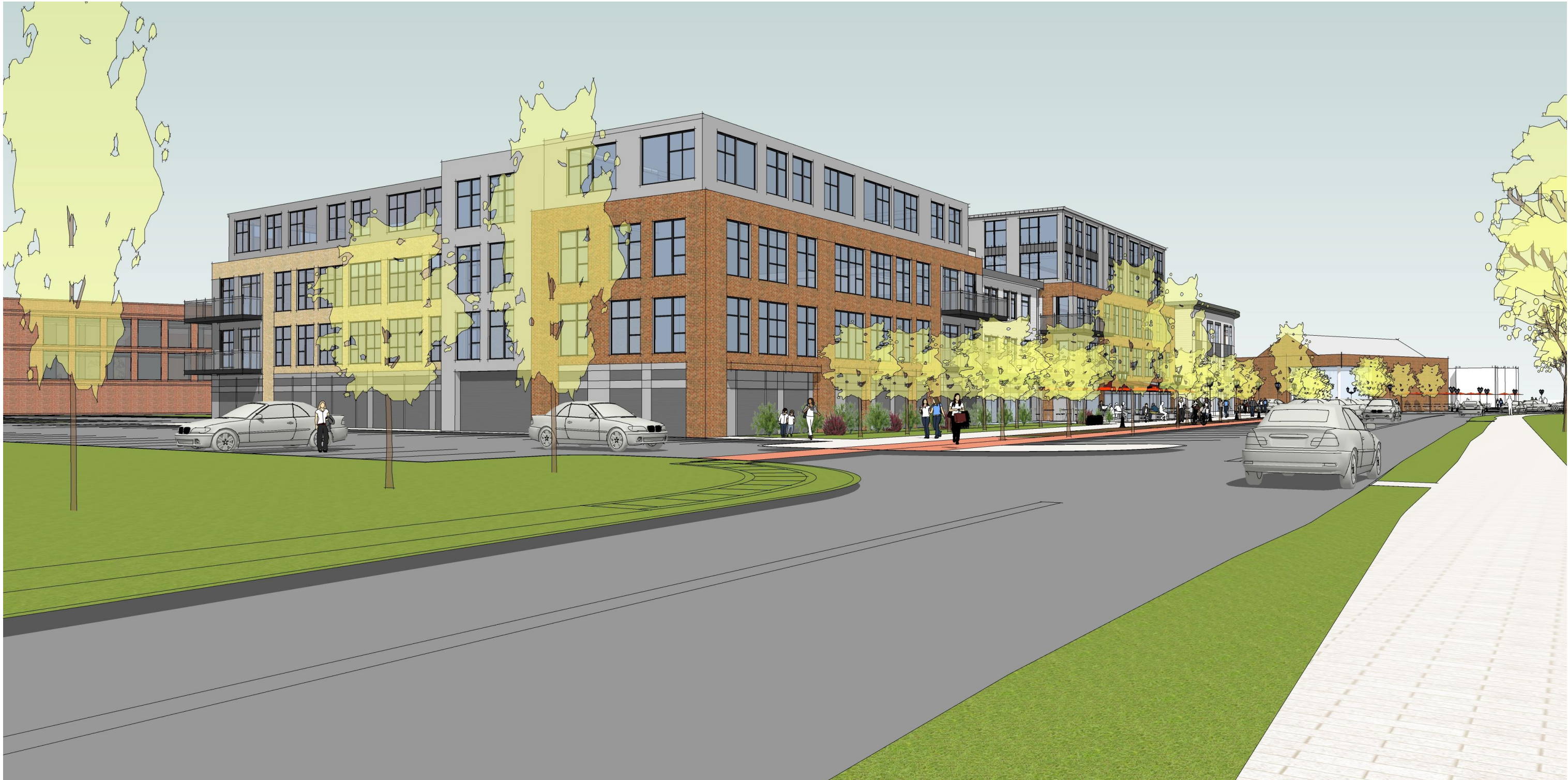
VIEW FROM RIVER ROAD DRIVING NORTH

SERIES OF VIEWS SHOWING HOW THE BUILDING IS VISIBLE FROM RIVER RD