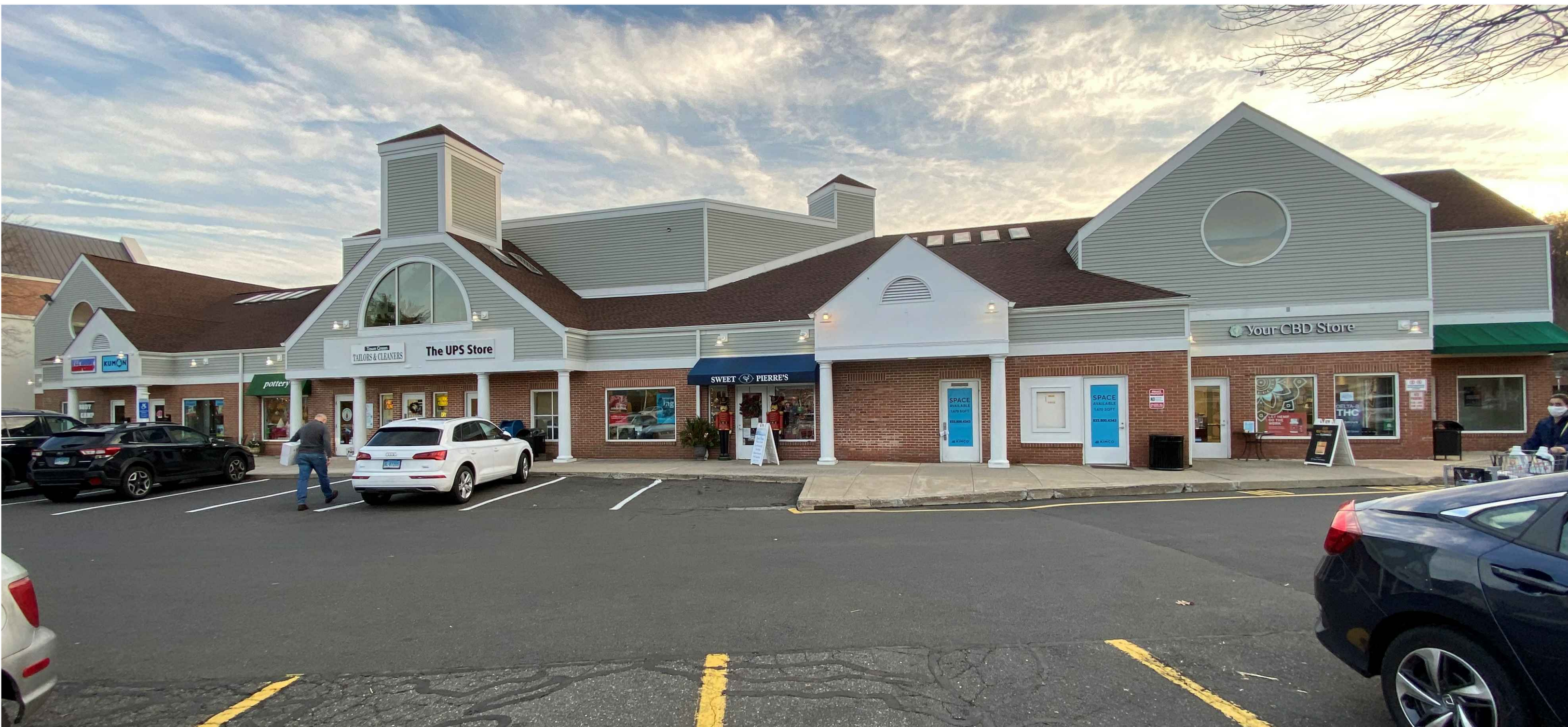
3 EXISTING ELEVATION Scale: NTS

NEW SIGN DESIGN AND SIZE BY NEW TENANT EXISTING DOOR TO REMAIN EXISTING DOOR TO REMAIN REMOVE EXISTING FACADE BRICK AND INSTALL NEW STOREFRONT WINDOW TO MATCH EXISTING REINSTATE EXISTING WINDOW TO MATCH EXISTING