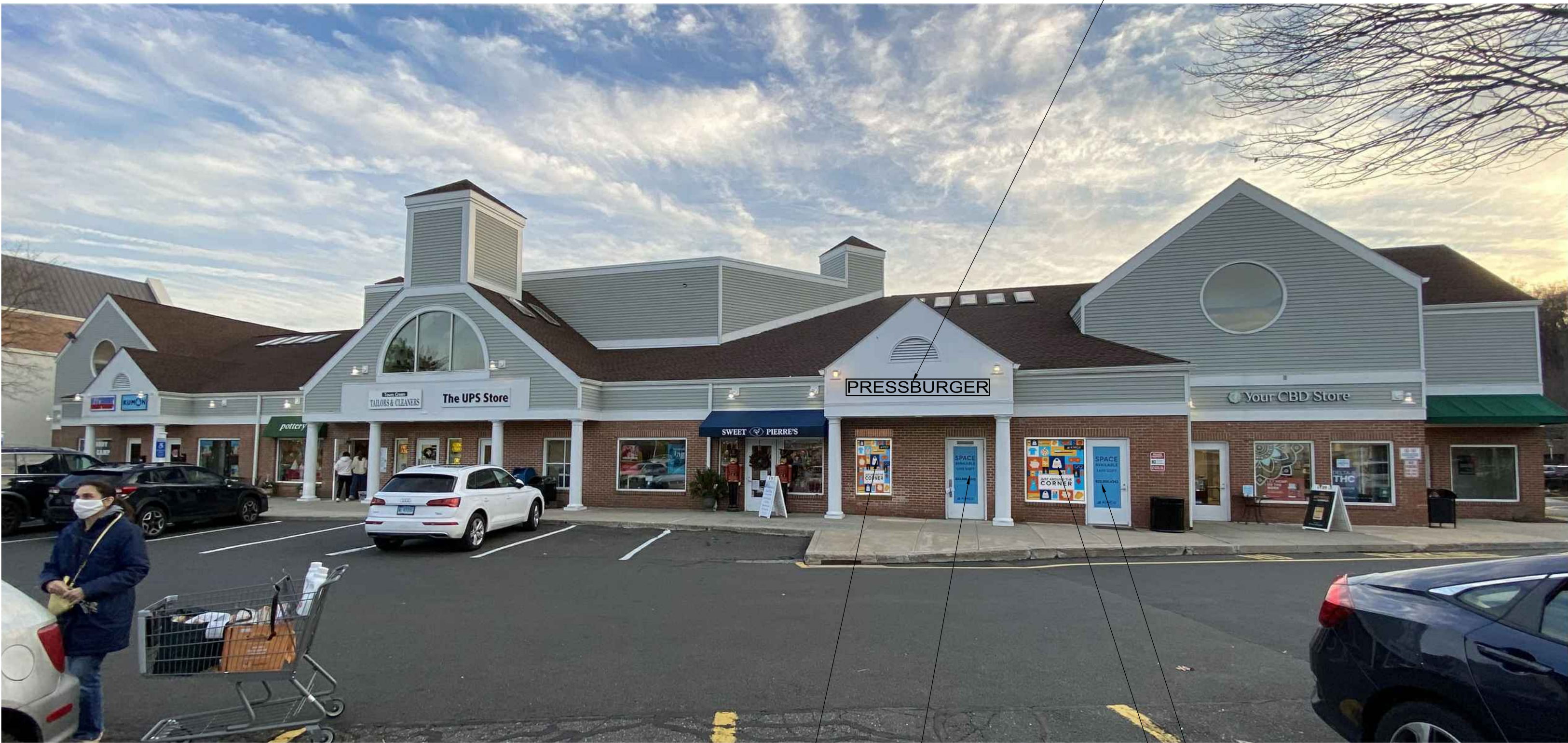
1 PROPOSED ELEVATION Scale: NTS

NEW SIGN DESIGN AND SIZE BY NEW TENANT EXISTING DOOR TO REMAIN EXISTING DOOR TO REMAIN REMOVE EXISTING FACADE BRICK AND INSTALL NEW STOREFRONT WINDOW TO MATCH EXISTING REINSTATE EXISTING WINDOW TO MATCH EXISTING