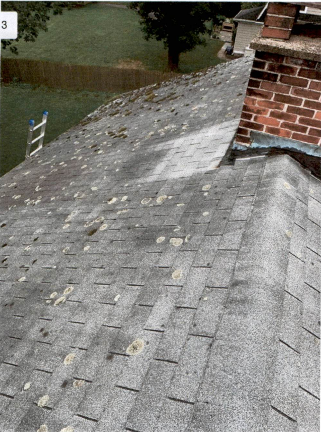
Project: Pete Maxfield Date: 8/17/2023, 3:50pm Creator: Brock Wehry