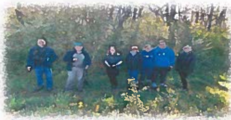
May 6 th Walkers

Ten participants attended the Conservation Commission's May 6th bird walk at Bennett's Pond State Park, one of Ridgefield's great open spaces. Early May was a fantastic time to be looking for birds in Ridgefield, as this was the peak time to see migrating birds passing through on their way from Central and South American wintering grounds to breeding grounds from here to the arctic. Our walk produced fifty-five species of birds, including some uncommon, hard to find species. At the Fox Hill Lake marsh, we observed two Virginia Rails, an extremely difficult to see "skulker." At Bennett's Pond we were treated to views of twelve different warblers, including the rare Hooded Warbler. Three flyover Broad-winged Hawks were a nice surprise. Deep in the woods we were surprised by the beautiful song of a tiny Winter Wren. After some careful scanning of the forest, we were able to locate this little guy singing his heart out on a small stump. And at the far end of Bennett's Pond, we were treated to looks at a secretive Marsh Wren!