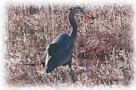
The Great Blue Heron

It is always so exciting to see who is visiting Bennett's Pond! The Great Blue Heron and masked Cedar Waxwing were spotted recently. There is nothing like Ridgefield's open spaces and trails! Make sure to take a hike and enjoy YOUR land this summer!