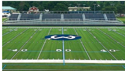
GOOD MORNING WILTON

The first of its kind in the State, this environmentally-friendly field with concussion padding, provides a safer playing field for high school athletes and youth sports participants.