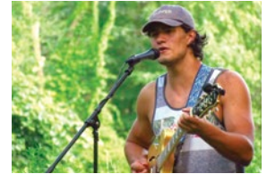
GOOD MORNING WILTON

Wilton has an abundance of free concerts during the summer, including weekday concerts in the acclaimed Brubeck room at Wilton Library and weekend outdoor concerts at Merwin Meadows and Schenck's Island.