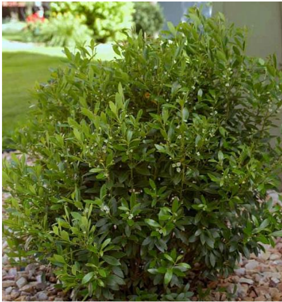
‘Shamrock’ Inkberry/Gallberry Holly “ ilex glabra ” Broadleaf evergreen shrub